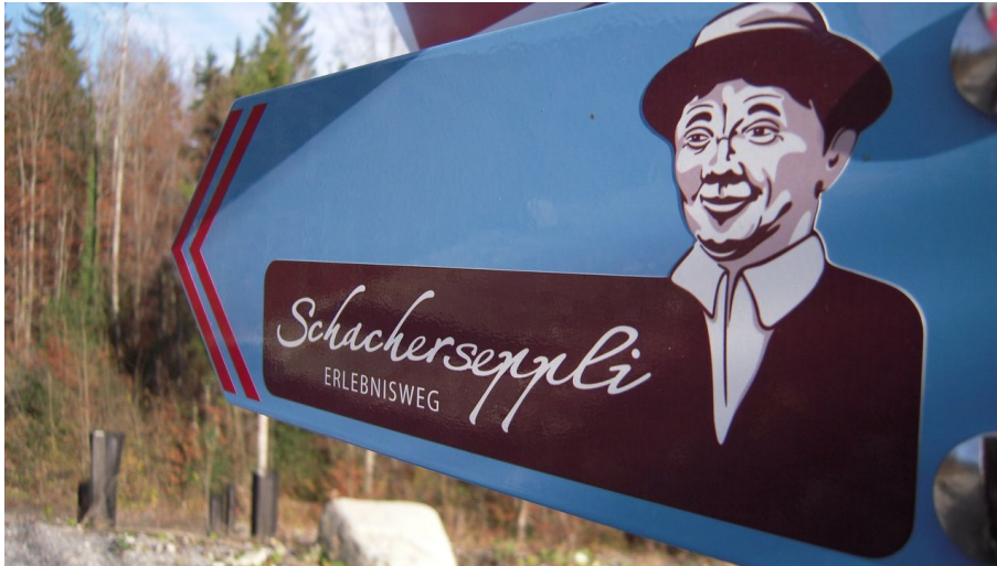
Obwalden Tourismus, Obwalden Tourismus