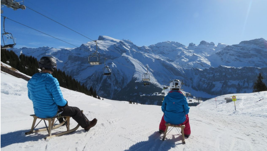
Engelberg - Titlis Tourismus, Engelberg-Titlis Tourismus