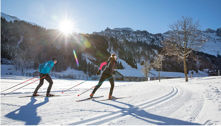
Engelberg - Titlis Tourismus, Engelberg-Titlis Tourismus