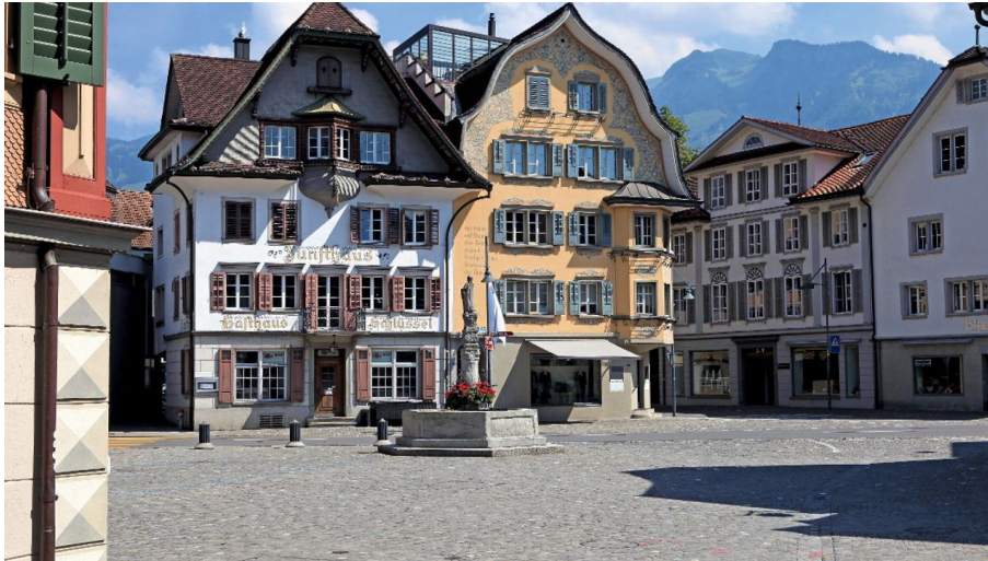
Obwalden Tourismus, Obwalden Tourismus