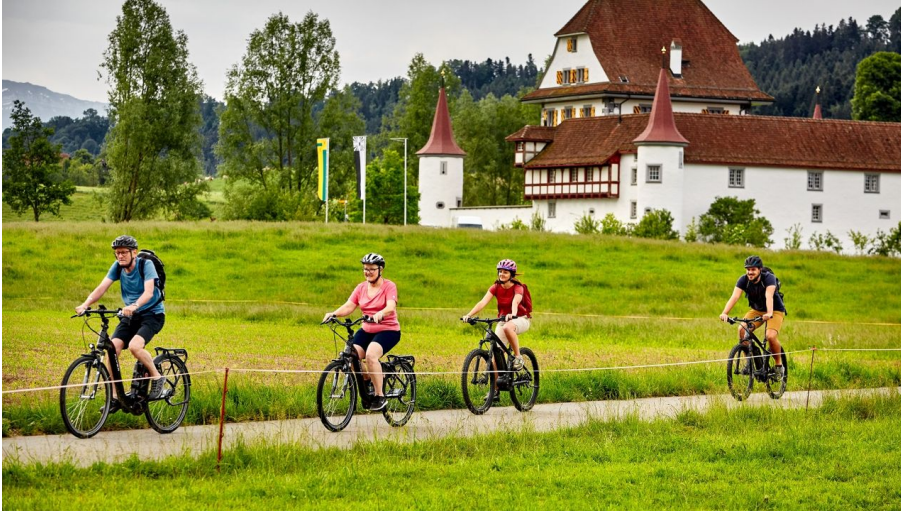
Willisau Tourismus, Willisau Tourismus