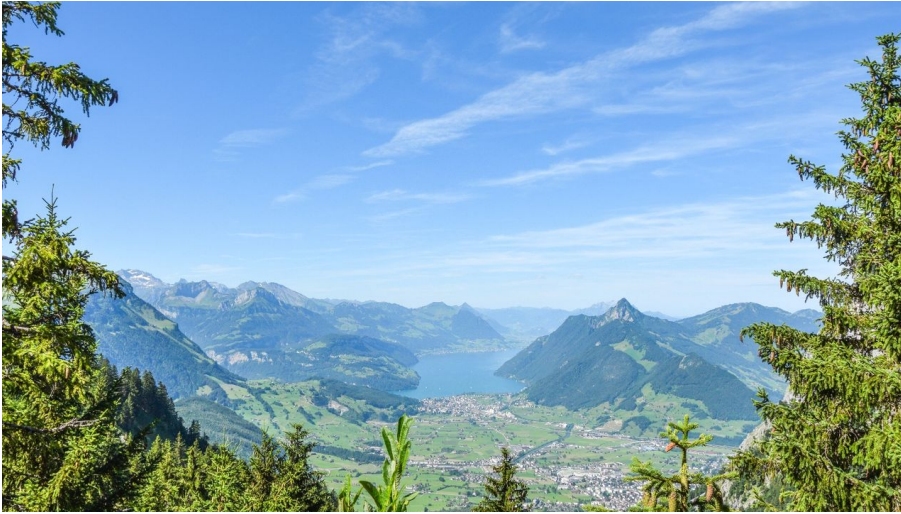
Erlebnisregion Mythen, Region Luzern-Vierwaldstättersee