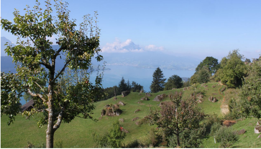
Tourist Information Weggis (Luzern Tourismus AG), Tourist Information Weggis