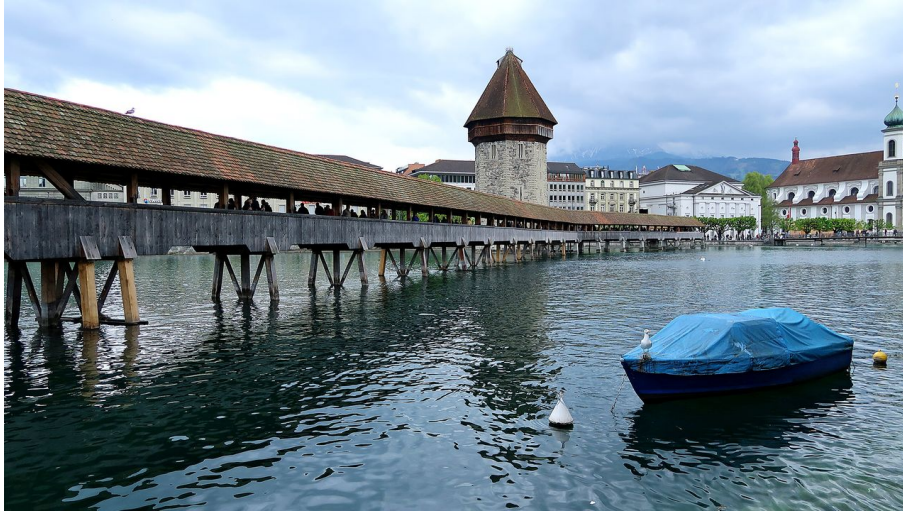
Jochen Ihle, Tourenplaner SCHWEIZ