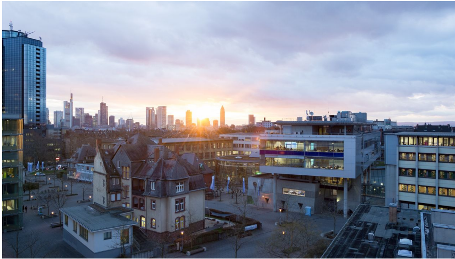
UAS-11578_DSC_0211-2.jpg - © Frankfurt UAS, Kevin Rupp | KOM