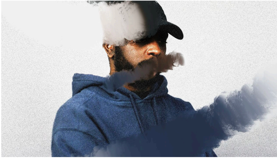
Press Shot 1 by Kay Ibrahim.jpg