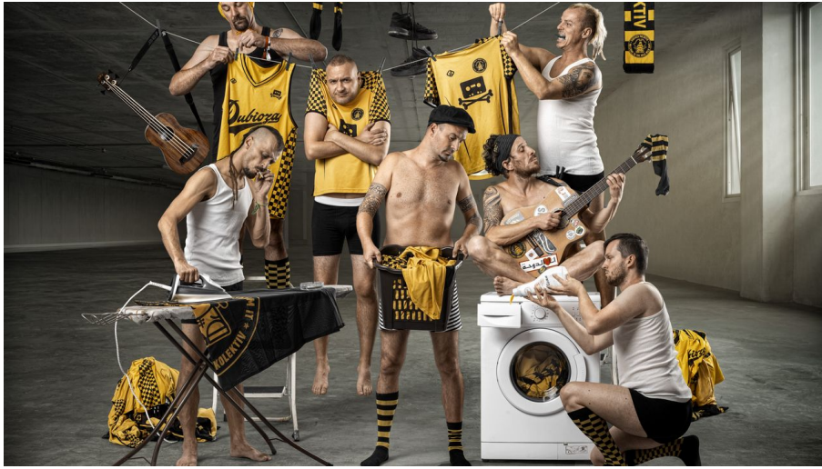
DK Horizontal Promo photo.jpg