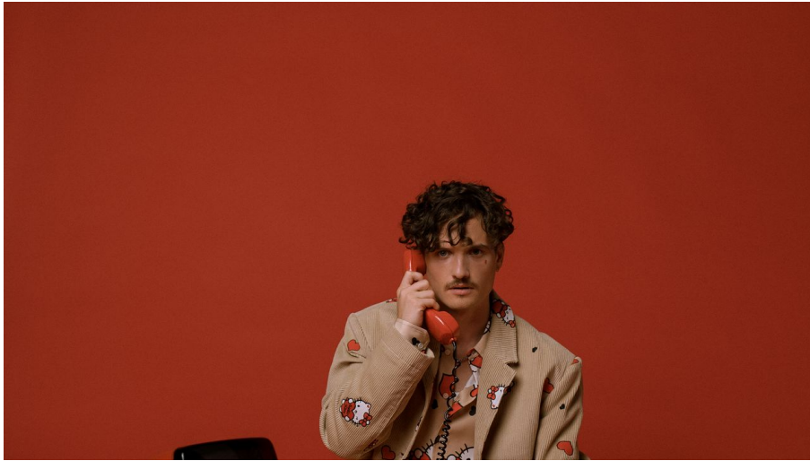
credit_philipp_gladsome-2971.jpg - © Philipp Gladsome