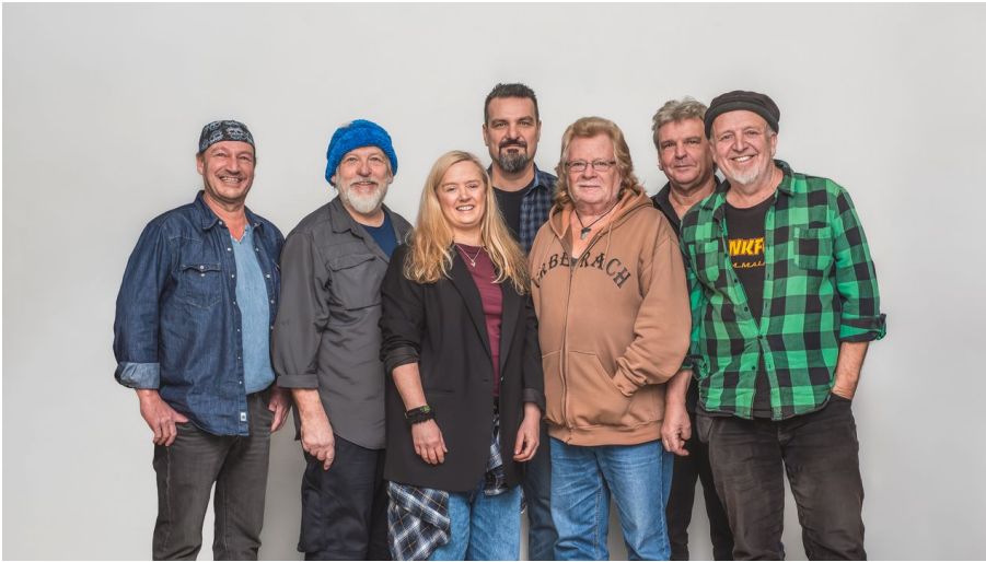
Rodgau Monotones NEU Carina Augusto(1).jpg