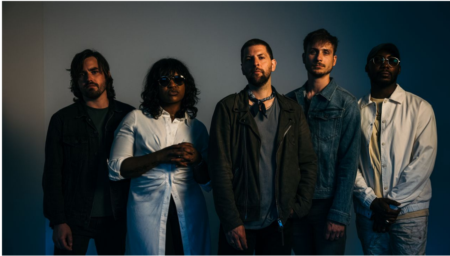
210718_WelshlyArmsSelects_0006.jpg - © Peter Larson