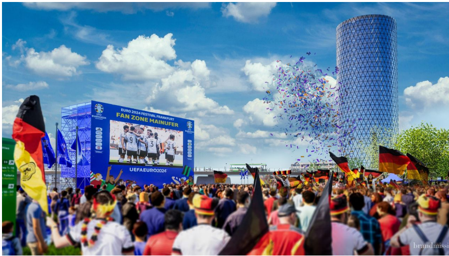
Frankfurt_Fan Zone Mainufer Big Screen und Fans_© Brandmission.jpg - © Brandmission