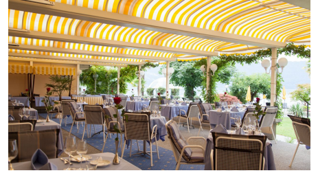
Garden terrace Beau Rivage