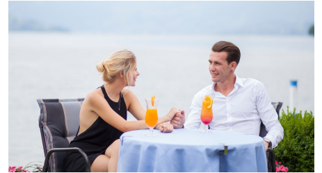
Beau Rivage Restaurant