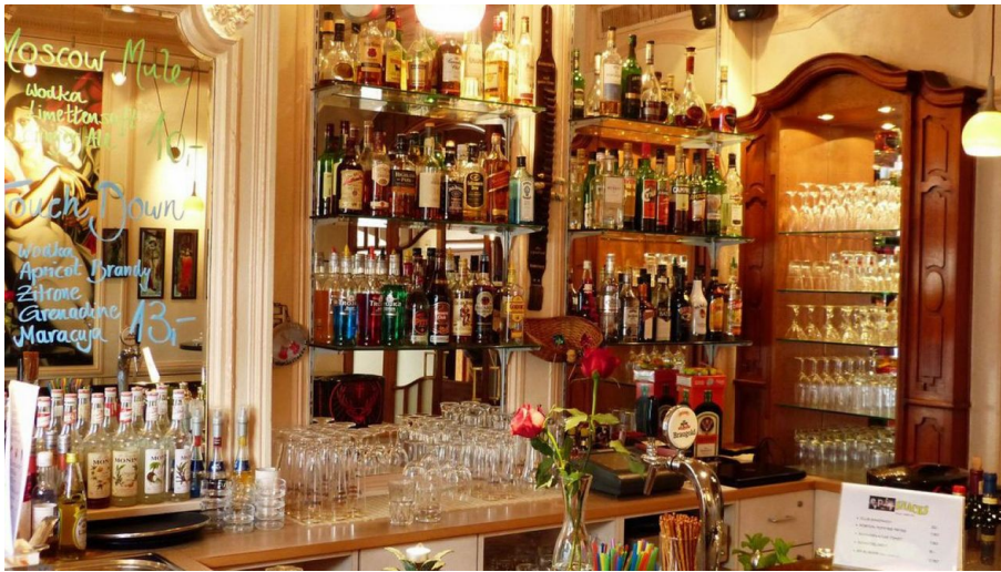
Epi Bar