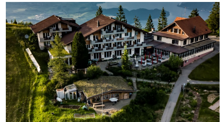
Edelweiss Restaurant Regina Montium Rigi