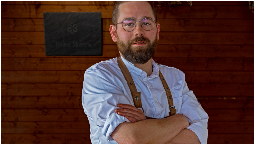
Edelweiss Restaurant Regina Montium Rigi - © Kräuterhotel Edelweiss Rigi