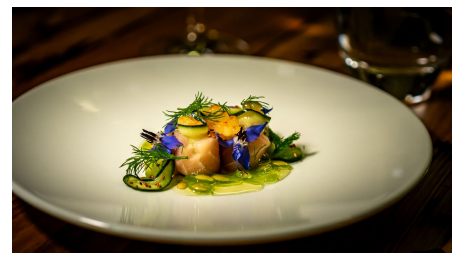
Edelweiss Restaurant Regina Montium Rigi