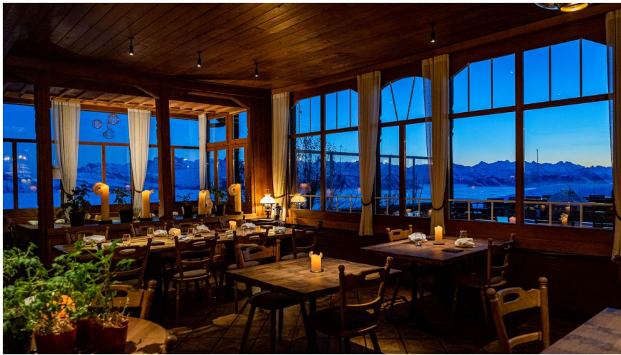
Edelweiss Restaurant Regina Montium Rigi