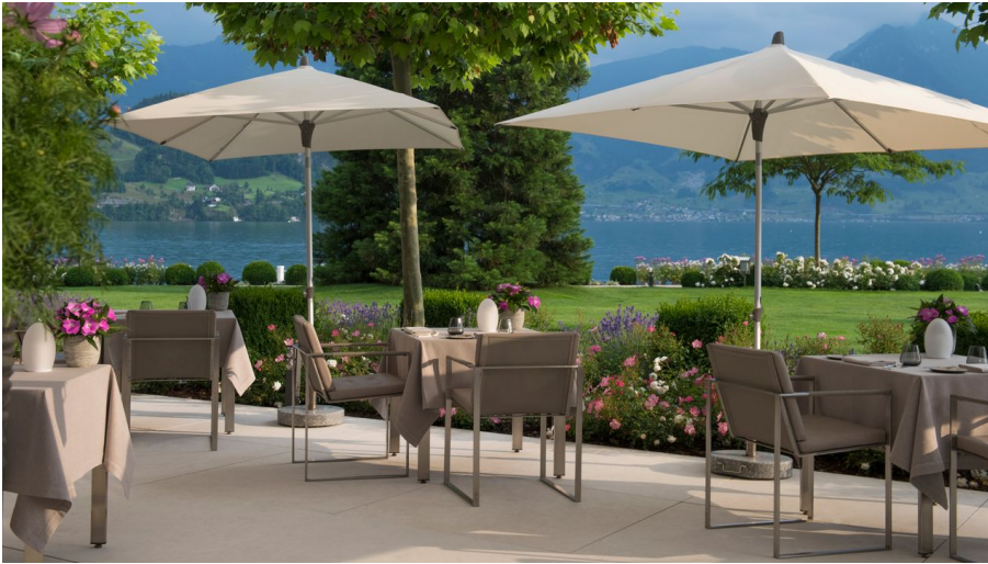
Grill Restaurant & Lake Terrace