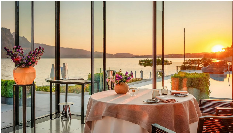
Restaurant focus Atelier