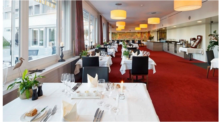
Sunset Restaurant