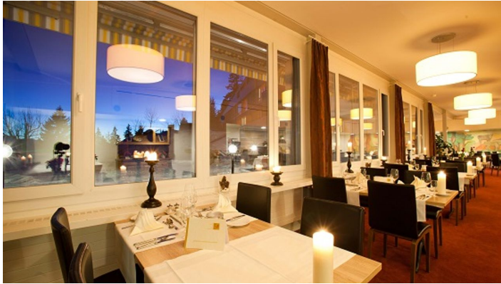
Sunset Restaurant