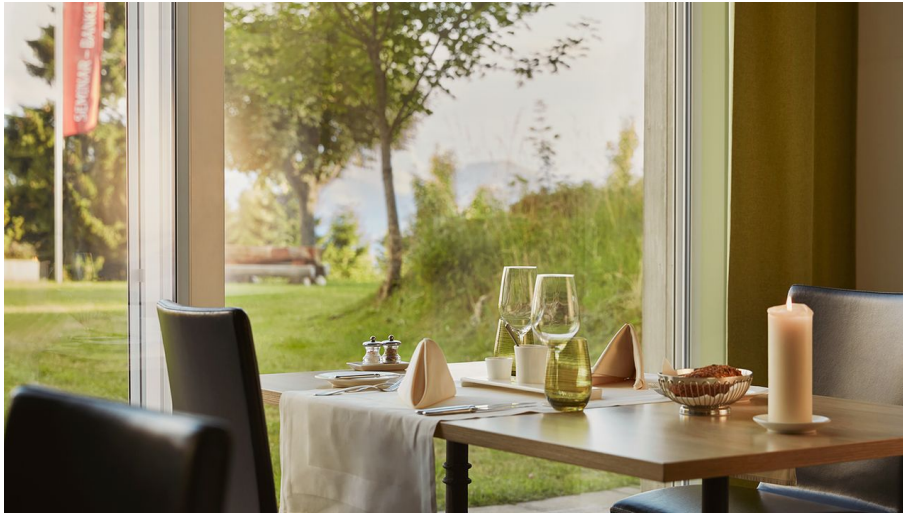
Restaurant Sunset Hotel Rigi Kaltbad