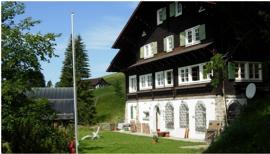
Bed and Breakfast be and mee