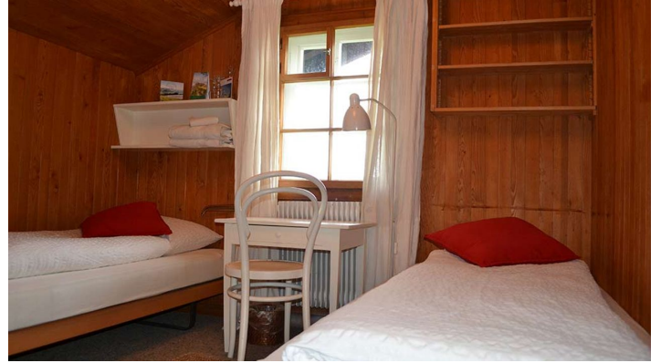
be and mee Bed and Breakfast