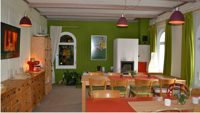
be and mee Bed and Breakfast