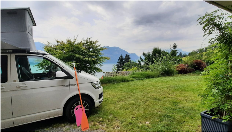
Camp Telli