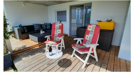
Stellplatz Telli_Sitzplatz Seesicht.jpg