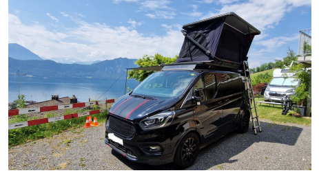
Camp Telli