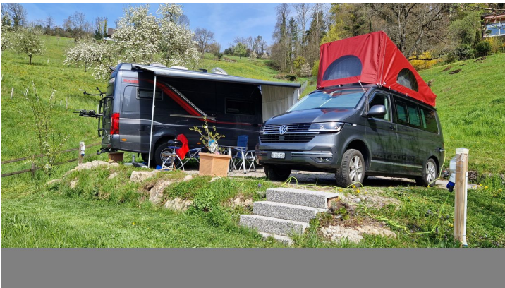
Stellplatz Telli_Camping Nord mit 2 Camper.jpg