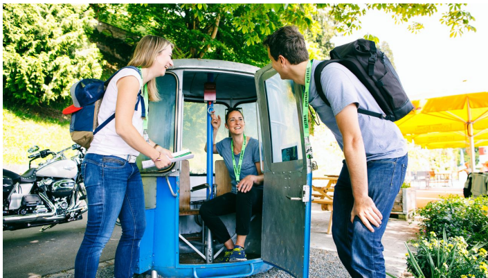
Foxtrail Helios Vitznau Weggis