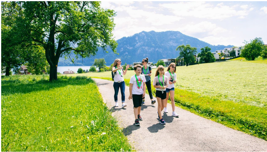
Foxtrail Helios Vitznau Weggis