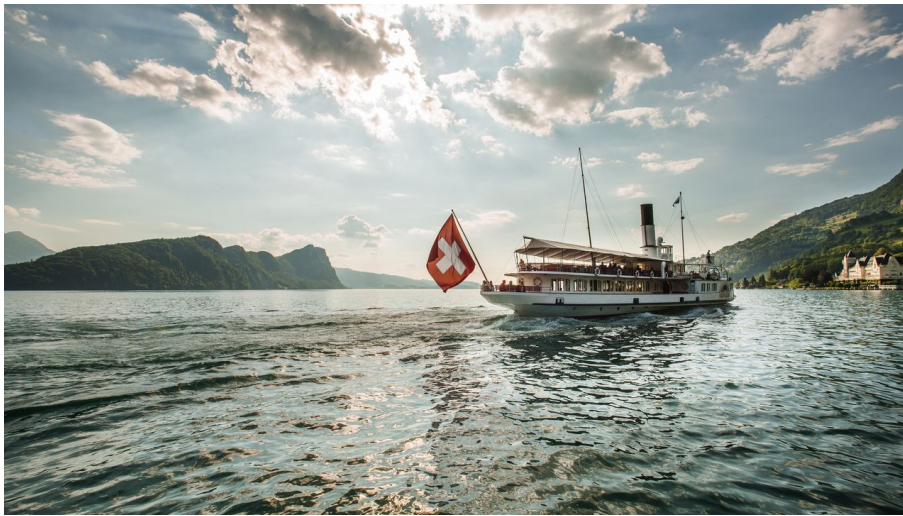
Steamboat Lake Lucerne