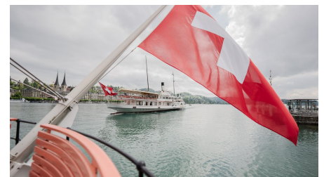
Steamboat Lake Lucerne