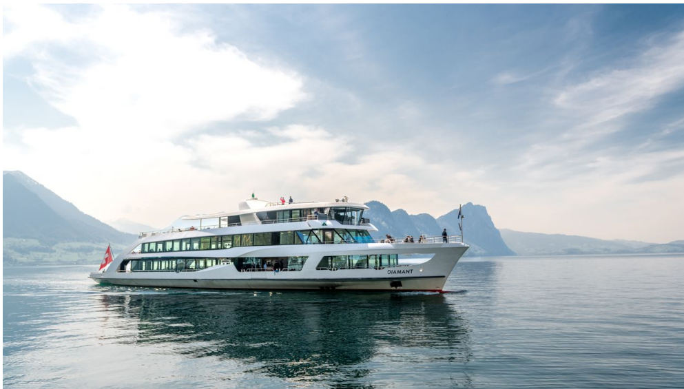
Motorboat Diamond Lake Lucerne - © Roger Gruetter