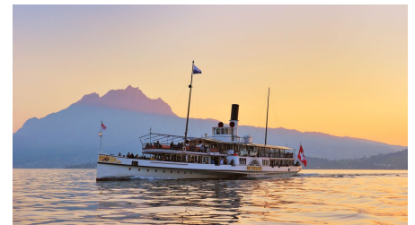
Steamboat Unterwalden