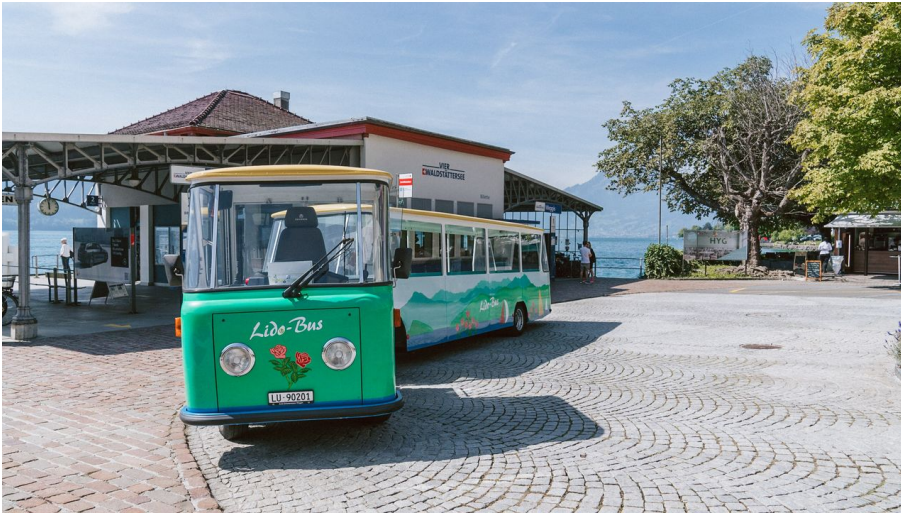
Lidobus Weggis