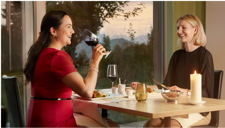
Königinnentage Hotel Rigi Kaltbad.jpg