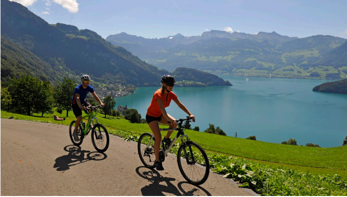
Rent a bike, ride a bike - © Christian Perret