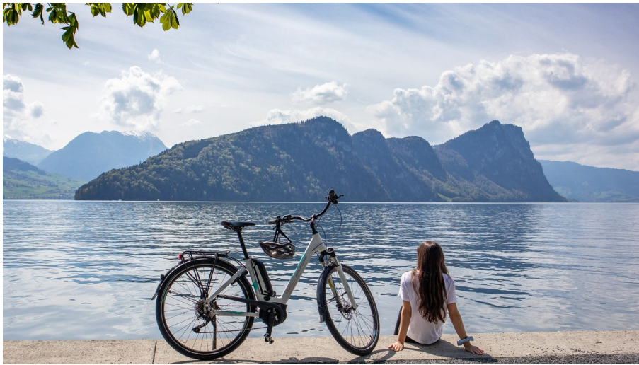
Rent a bike, ride a bike