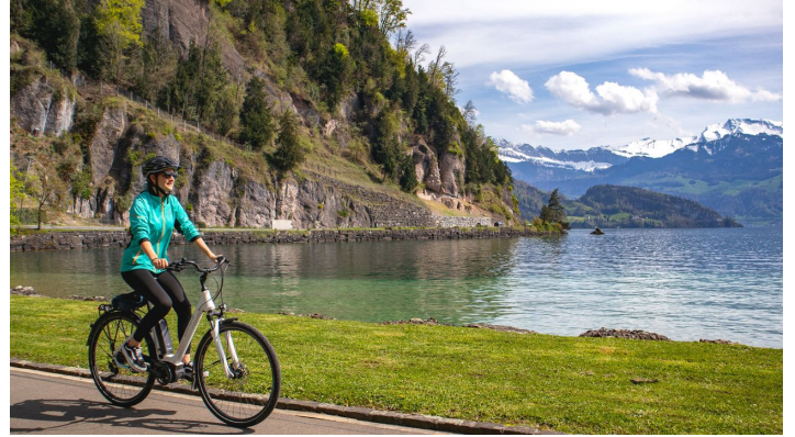
Rent a bike, ride a bike