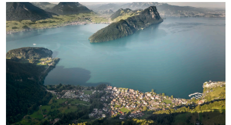
Riviera scavenger hunt Vitznau