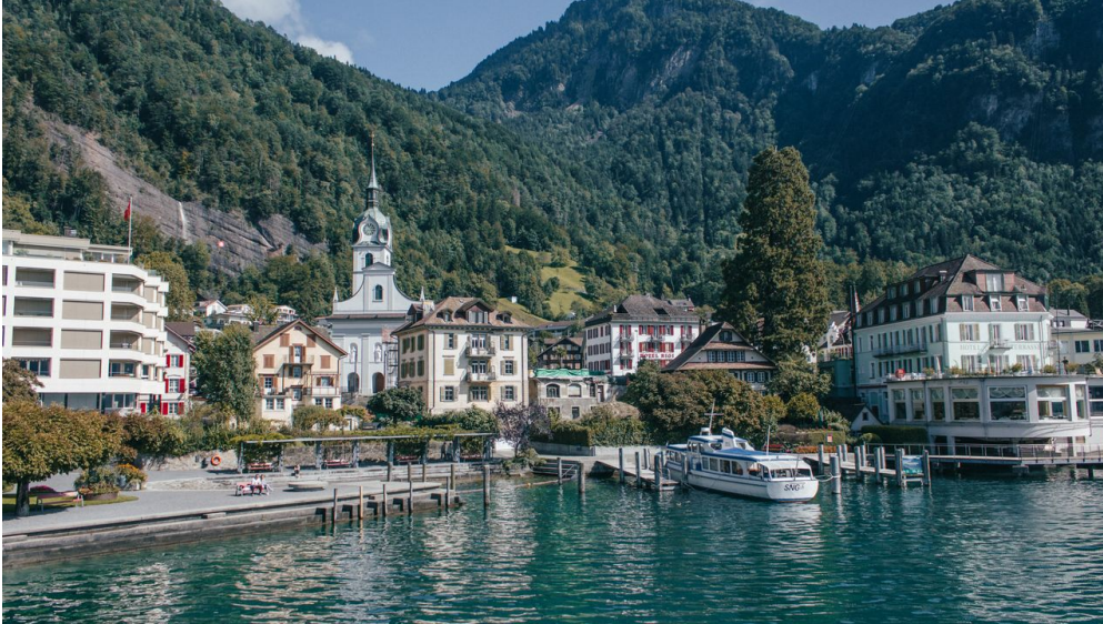
Riviera scavenger hunt Vitznau

Family segment Accessibility / location Near the forest