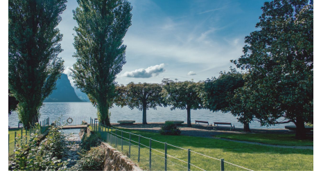
Riviera scavenger hunt Vitznau - © Luzern Tourismus, Laila Bosco