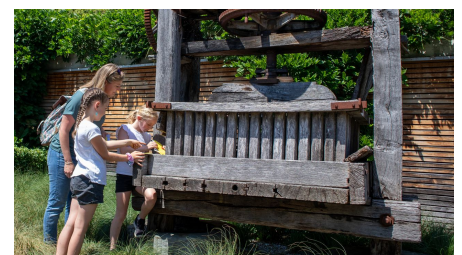
Riviera scavenger hunt Weggis - © Tamara Stalder | Luzern Tourismus