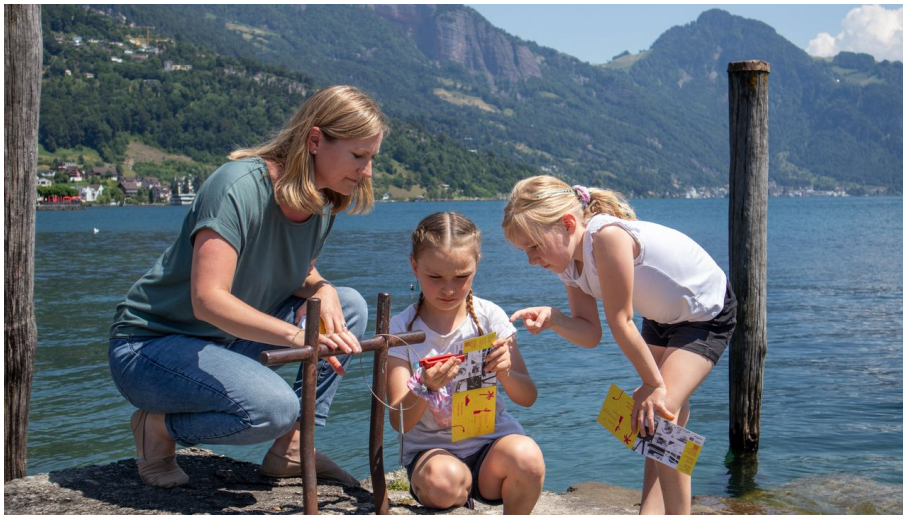
Riviera scavenger hunt Weggis