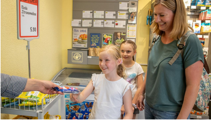
Riviera scavenger hunt Weggis - © Tamara Stalder | Luzern Tourismus