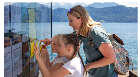
Riviera scavenger hunt Weggis