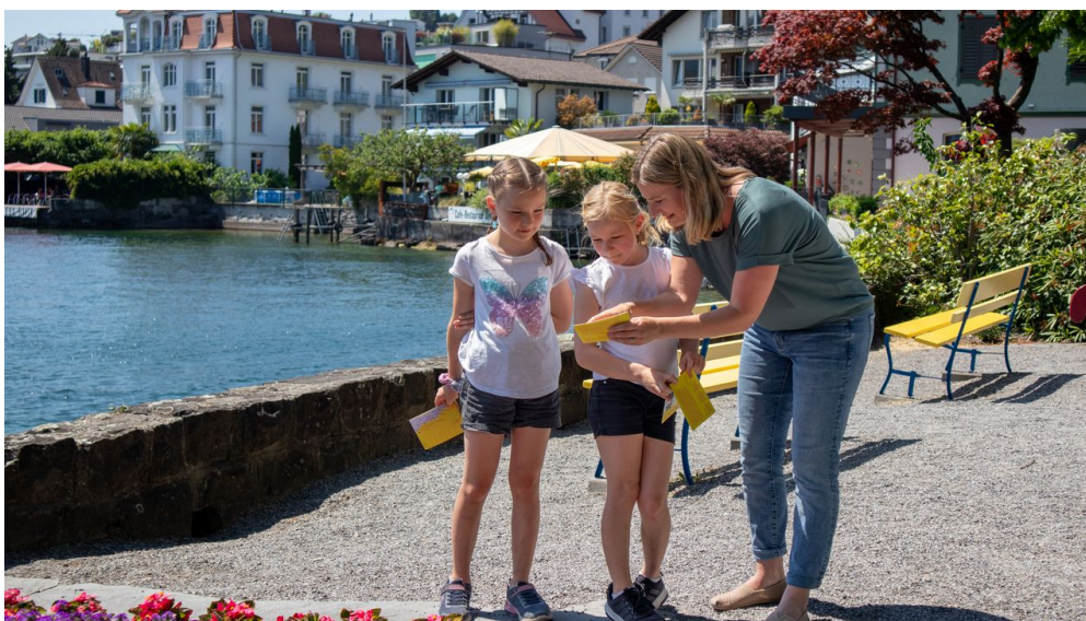
Riviera scavenger hunt Weggis