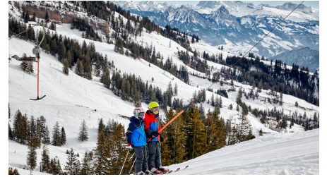
Skiing - © Luzern Tourismus, Beat Brechbühl