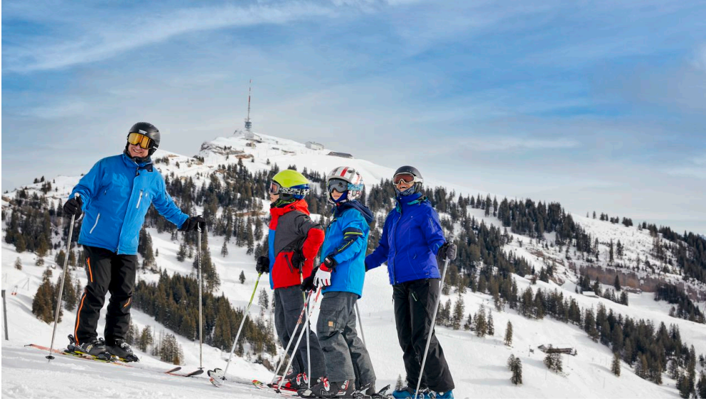
Skiing - © Luzern Tourismus, Beat Brechbühl