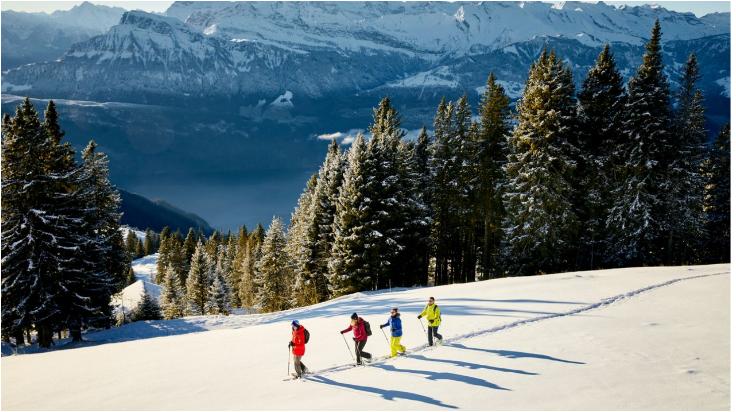
Snowshoe tours - © BEAT BRECHBUEHL