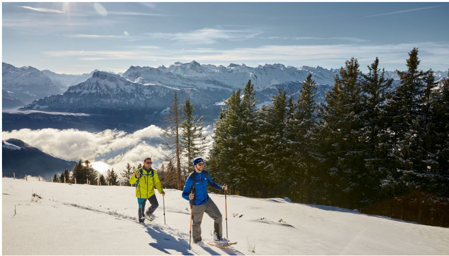
Snowshoe tours - © BEAT BRECHBUEHL