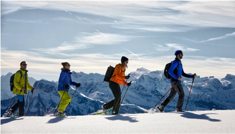
Snowshoe tours