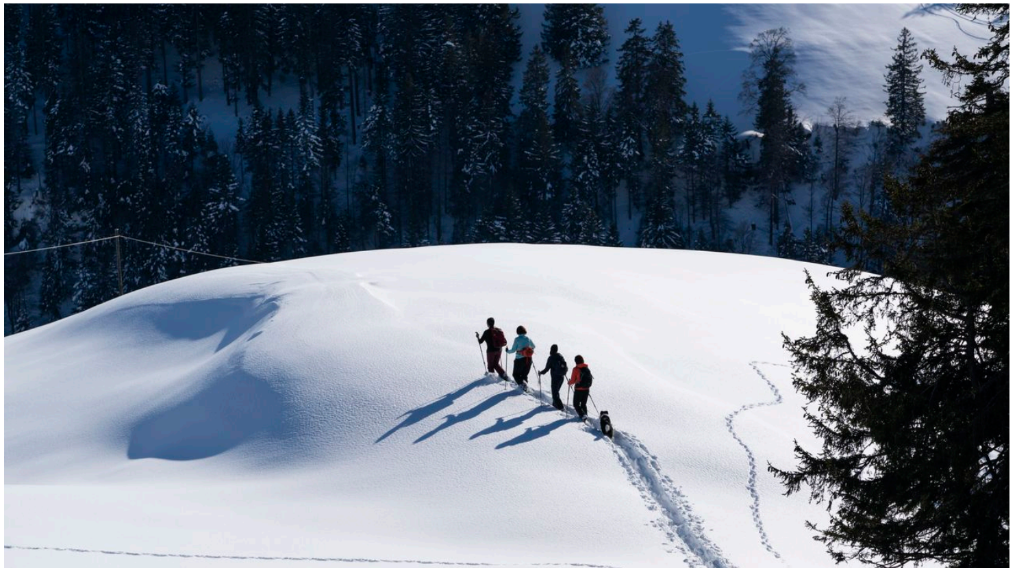
Snowshoe tours