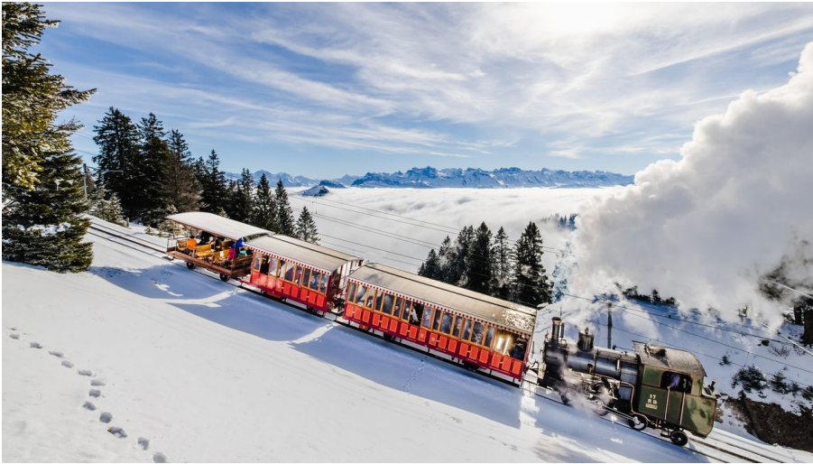
Winter steam train 17