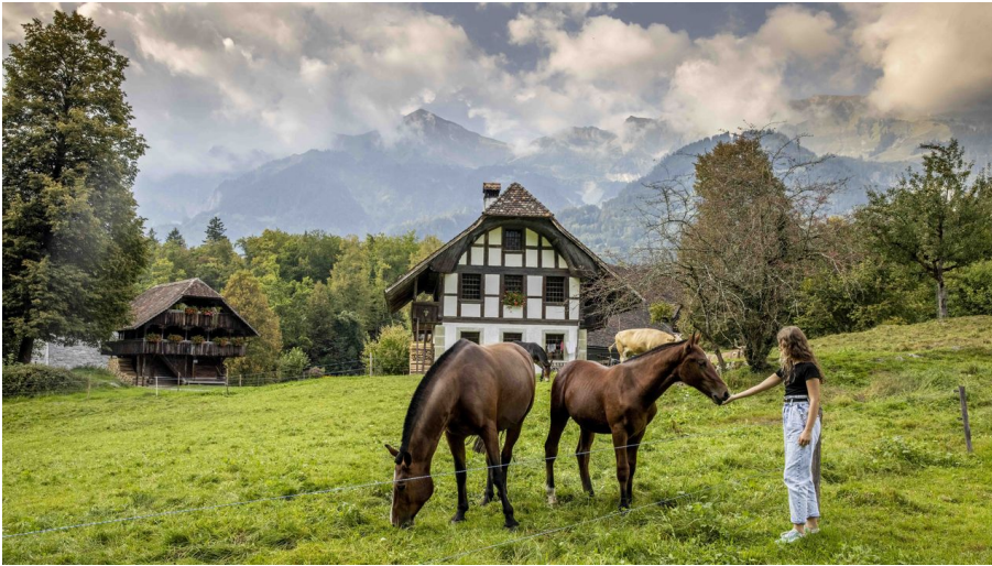
Ballenberg_Nidwalden_Brienz