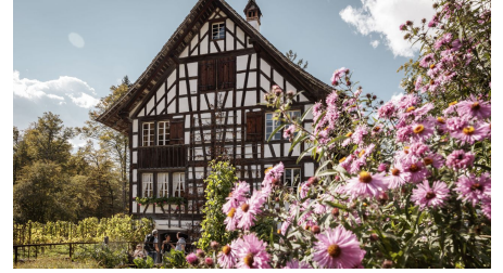
Ballenberg Open-Air Museum