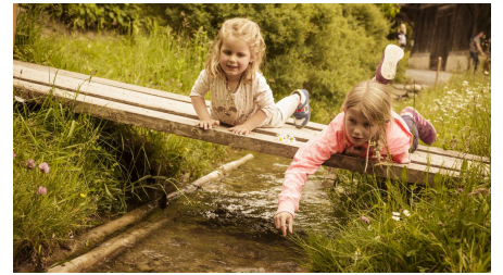
Ballenberg Open-Air Museum