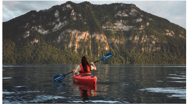
Kayak boat hire