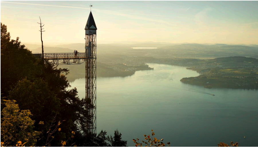
Bürgenstock Hammetschwand lift - © Luzern Tourismus, Beat Brechbühl