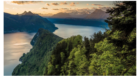
Bürgenstock view