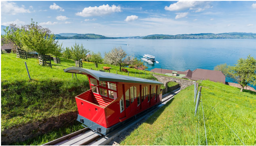
Shuttle boat funicular railway Buergenstock