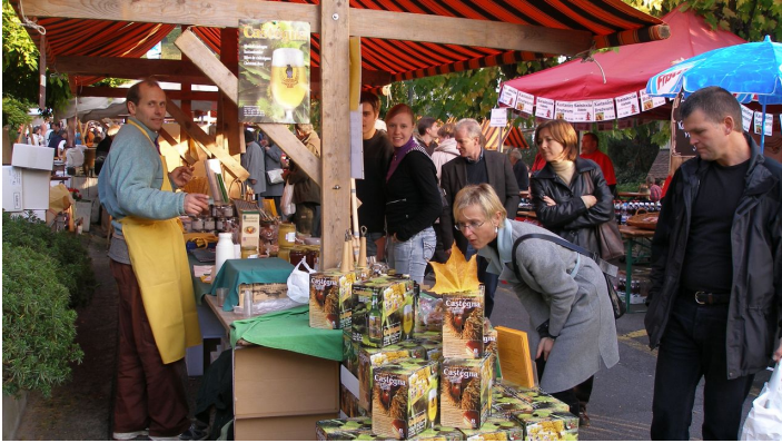
Chestnut fair