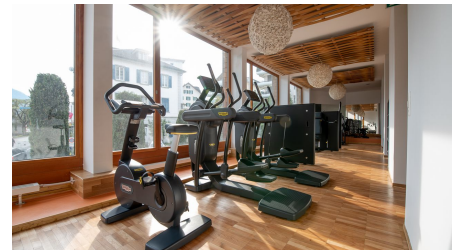
Equilibrium Spa and Beauty Hotel Rössli - © glupoog gmbh, Tobias Samuel Haas