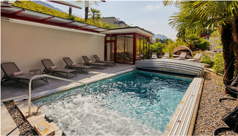
Equilibrium Spa and Beauty Hotel Rössli

Wellness | brine bath | Beauty salon | Massage studio