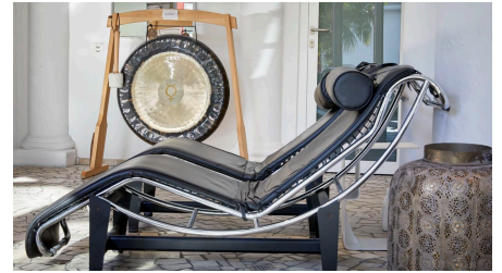
Equilibrium Spa and Beauty Hotel Rössli