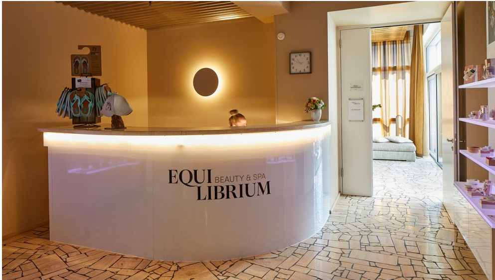
Equilibrium Spa and Beauty Hotel Rössli

Beauty & Spa: daily 10.00 a.m. - 7.30 p.m. Fitness room: daily 10.00 a.m. - 7.30 p.m.