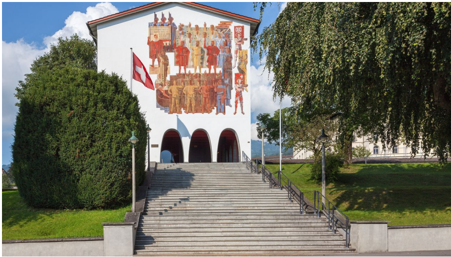
Federal Museum of Letters Schwyz