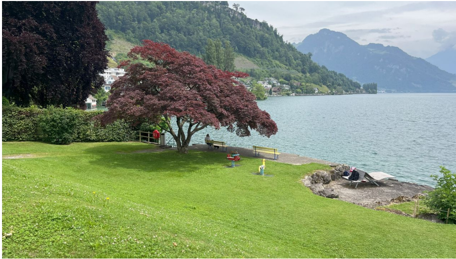
Badeplatz Felsberg (2).jpg