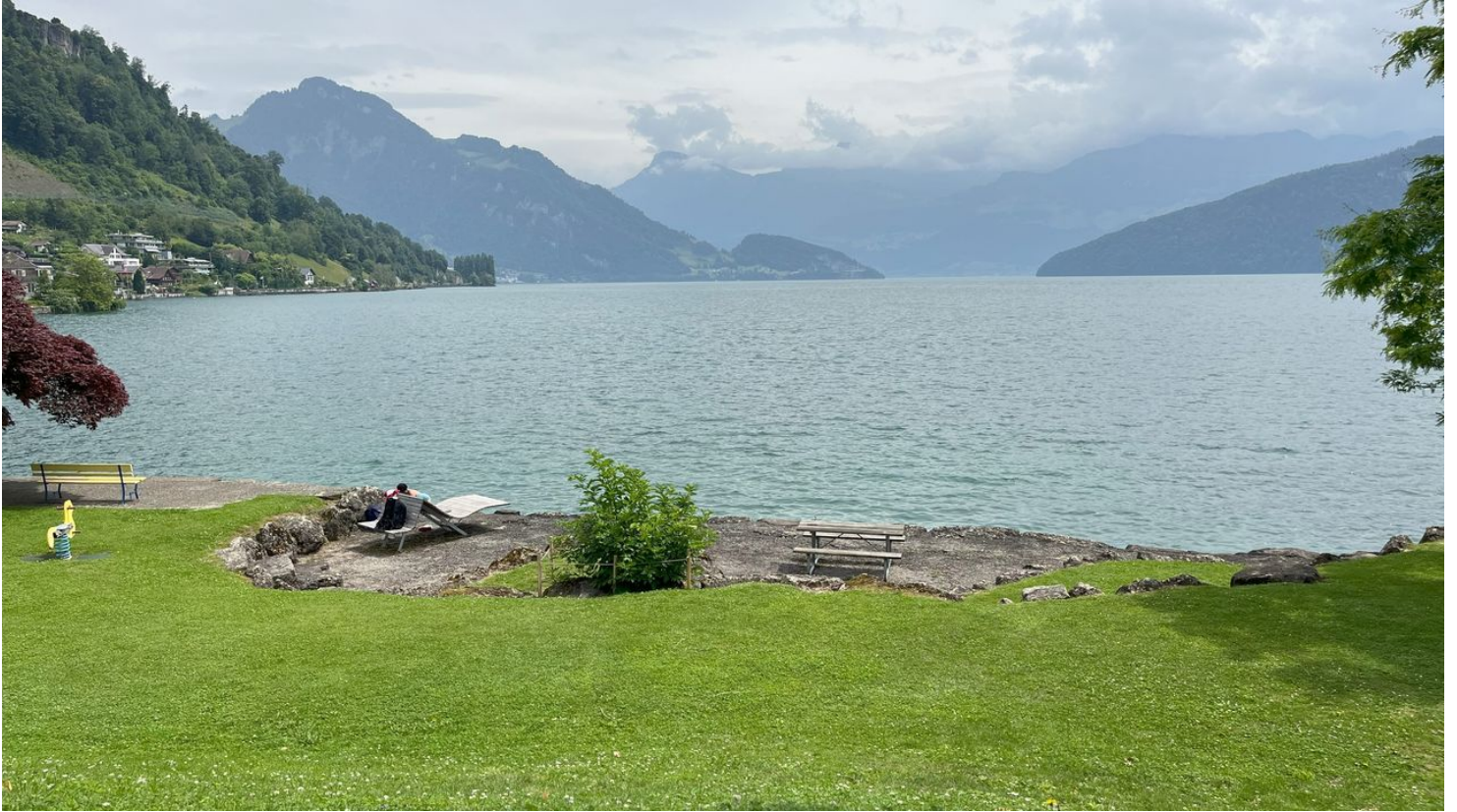
Badeplatz Felsberg (1).jpg