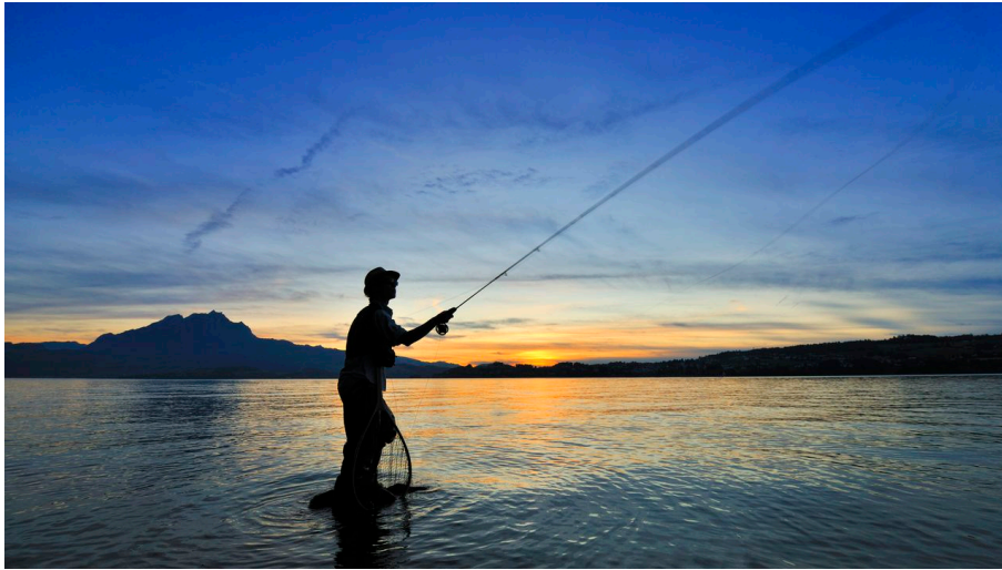
Fisherman Weggis