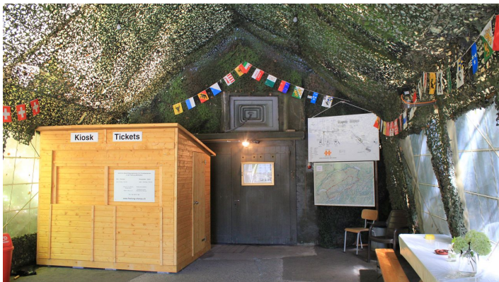
Vitznau Fortress entrance - © Verein Festung Vitznau

Price adult 20,00 CHF Price child 10,00 CHF