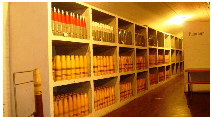
Vitznau fortress ammunition magazine