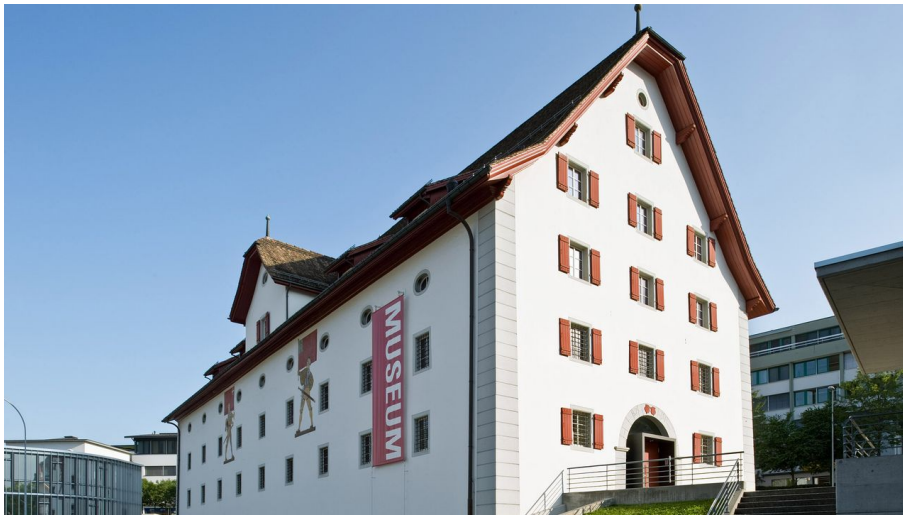
Forum Schweizer Geschichte Schwyz