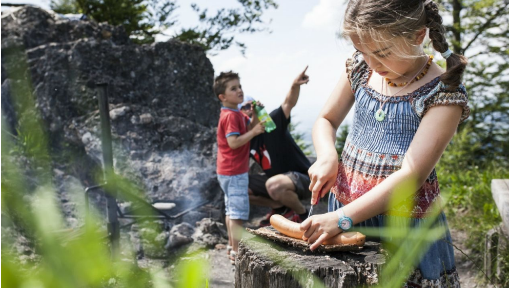
Bräteln auf der Rigi