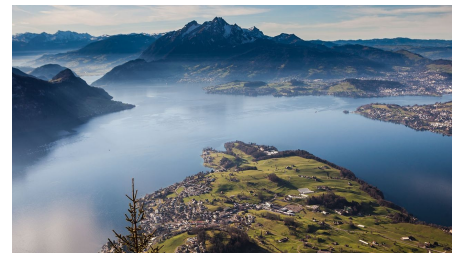
Känzeli