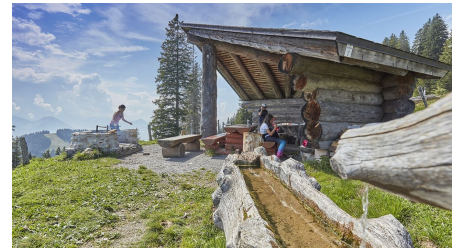
Gruebi Cha#serenholz_01