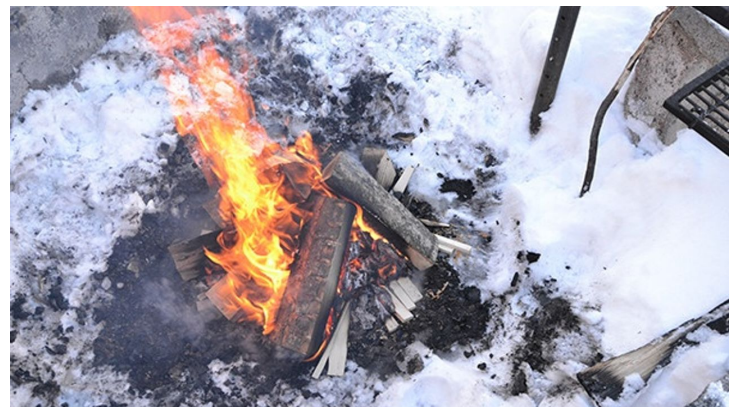
Winter Grill 4_zg