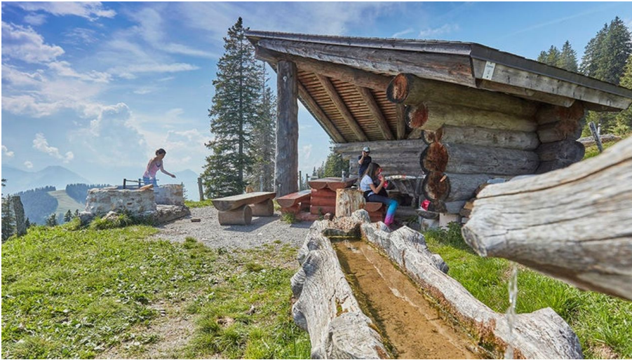
RALPH WELLING www.welling.ch