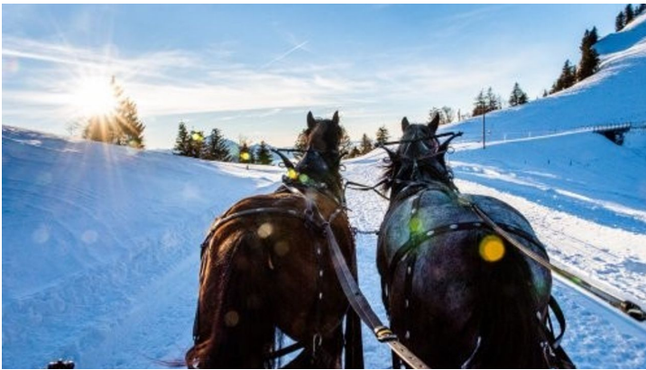
Pferdeschlitten Winter