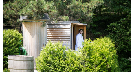
FloraAlpina-Sauna.jpg