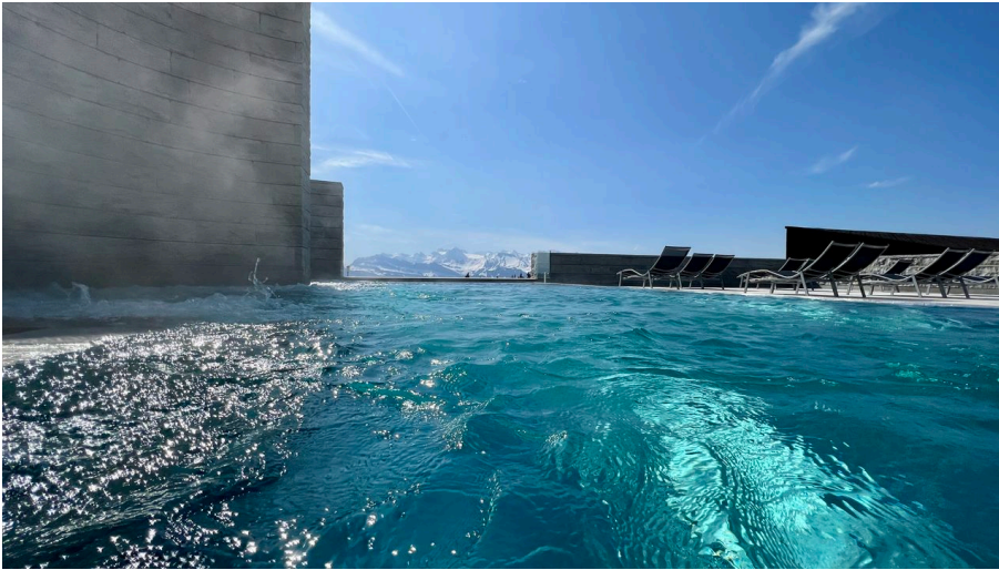
Mineral Bath & Spa Rigi Kaltbad