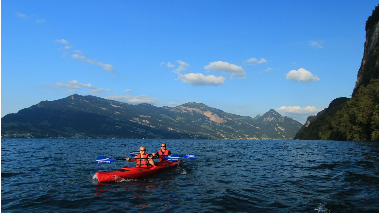
Kayak boat hire - © Luzern Tourismus AG, Markus Wolfsberg